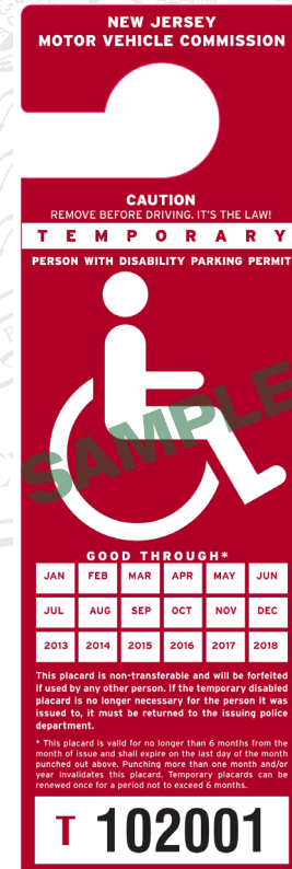
Exhibit D - Back